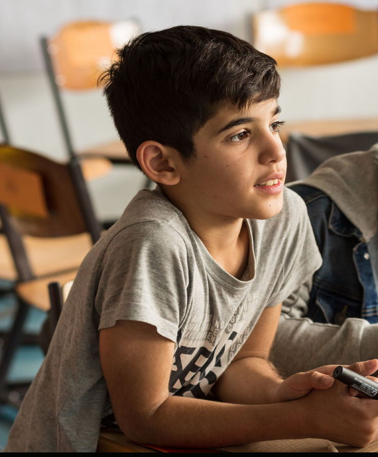
International Rescue Committee UK 100 Wood Street Barbican, London, EC2V 7AN

From Harm to Home rescue-uk.org rise.uk@rescue-uk.org